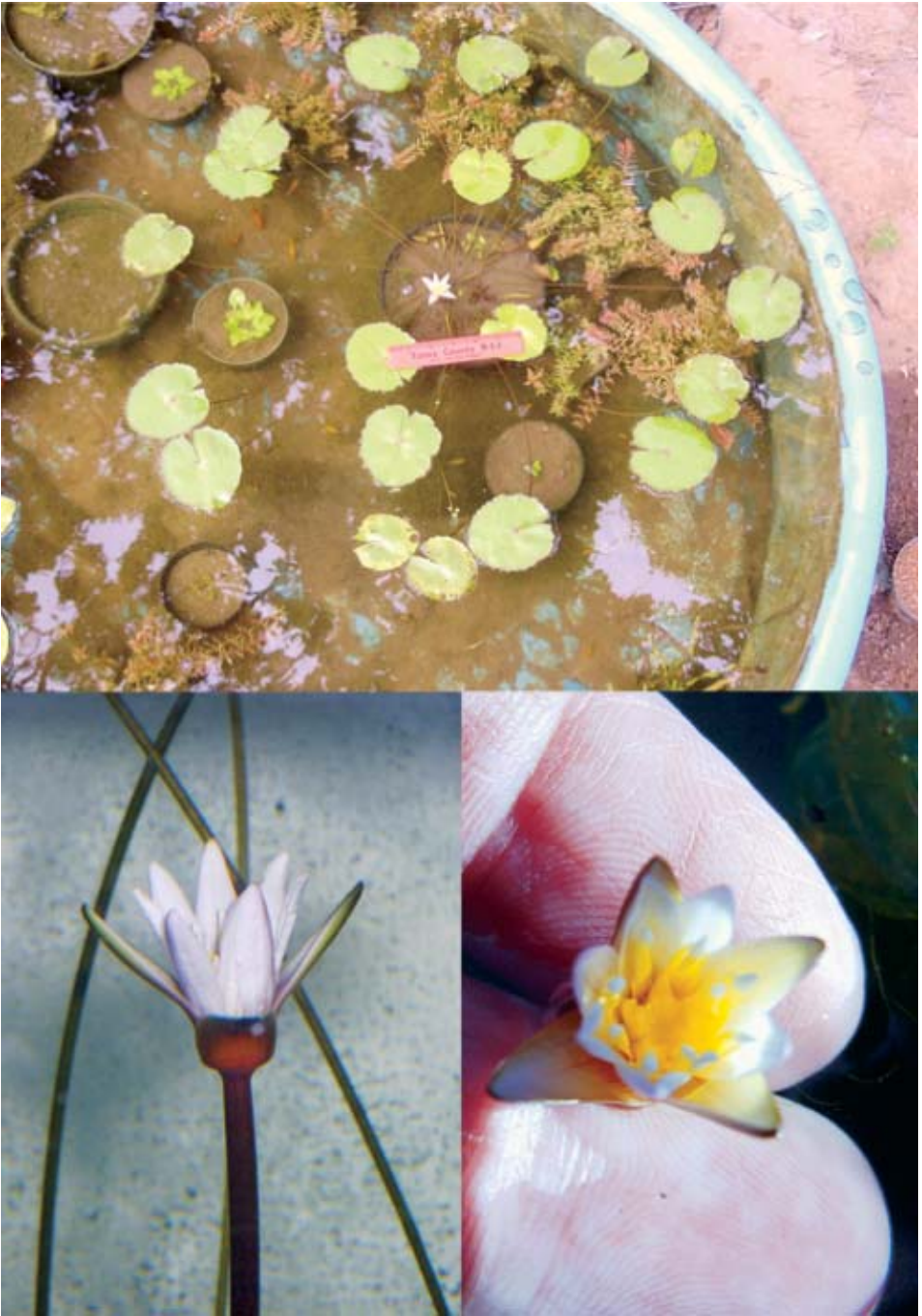
FIG. 4. Clockwise from top, mature Nymphaea minuta , emerged form with flower, ca. 60 cm wide; close up of flower showing stigmatic disk, carpellary styles and appendages on stamen; submerged flower fully open.