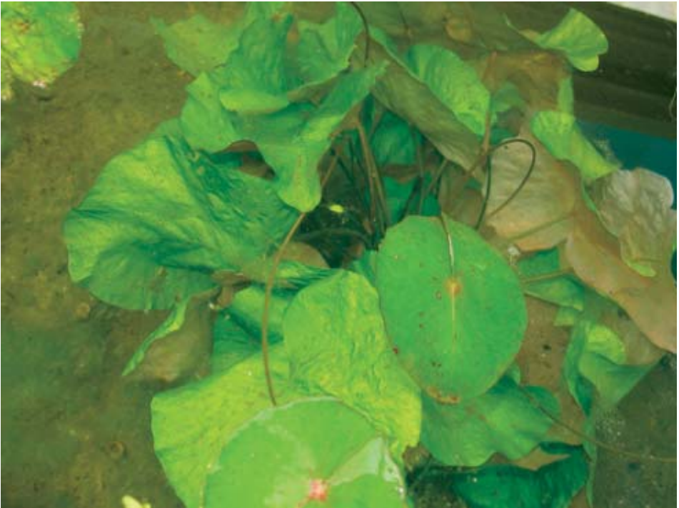
FIG. 3. Top, submerged plants under artificial light in an aquarium, not submerged bud on center plant. Bottom, submerged plant grown in pond under nature conditions in a tropical climate.