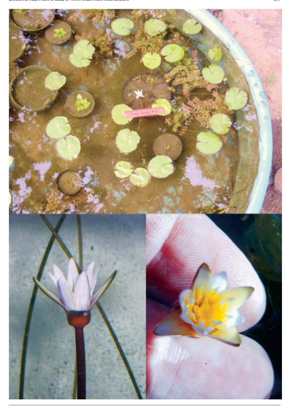
Fig. 4. Clockwise from top, mature Nymphaea minuta , emersed form with flower, ca. 60 cm wide; close up of flower showing stigmatic disk, carpellary styles and appendages on stamen; submerged flower fully open.