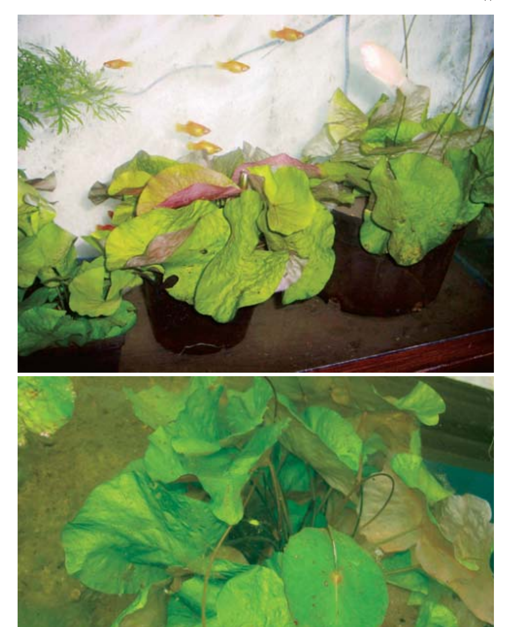
Fig. 3. Top, submerged plants under artificial light in an aquarium, not submerged bud on center plant. Bottom, submerged plant grown in pond under nature conditions in a tropical climate.